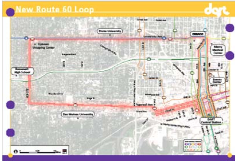
Proposed Route 60 Loop - Image Credit: DART