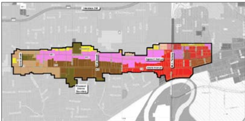
FIGURE 1: Current Ingersoll and Grand Ave. Zoning

While Ingersoll and Grand are very different streets, they have a symbiotic relationship. Grand Avenue has a large residential and student population, who patronize the commercial establishments on Ingersoll. Ingersoll offers the shops, restaurants, and commercial services which make living along Grand Avenue and in the adjacent neighborhoods so appealing. Together, Ingersoll and Grand form one of Des Moines' most urban districts.