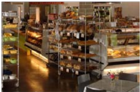
Palmer's Deli on Ingersoll