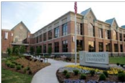
Des Moines University on Grand Ave.