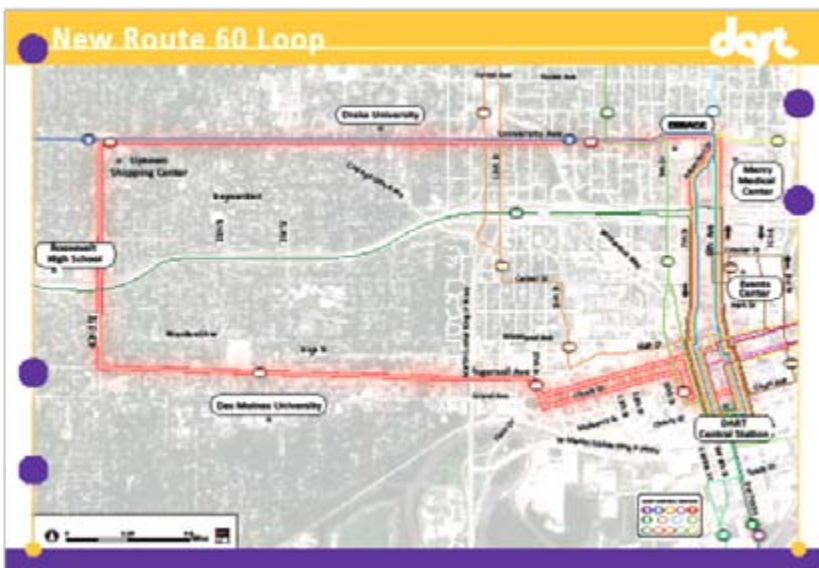
Proposed Route 60 Loop - Image Credit: DART