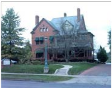
Community Foundation of Greater Des Moines on Grand Ave.