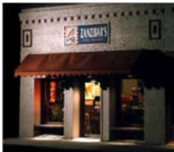
Zanzibar's Coffee on Ingersoll