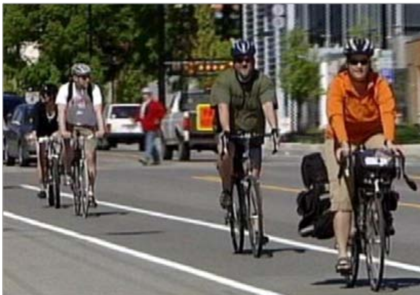
Cyclists Using New Bike Lanes

Route 60 is intended to become Des Moines's first Bus Rapid Transit (BRT) route. This will be discussed in Section 4 of this report. This will provide a major increase in public service not only for Ingersoll and Grand, but Downtown and Des Moines' West Side in general.